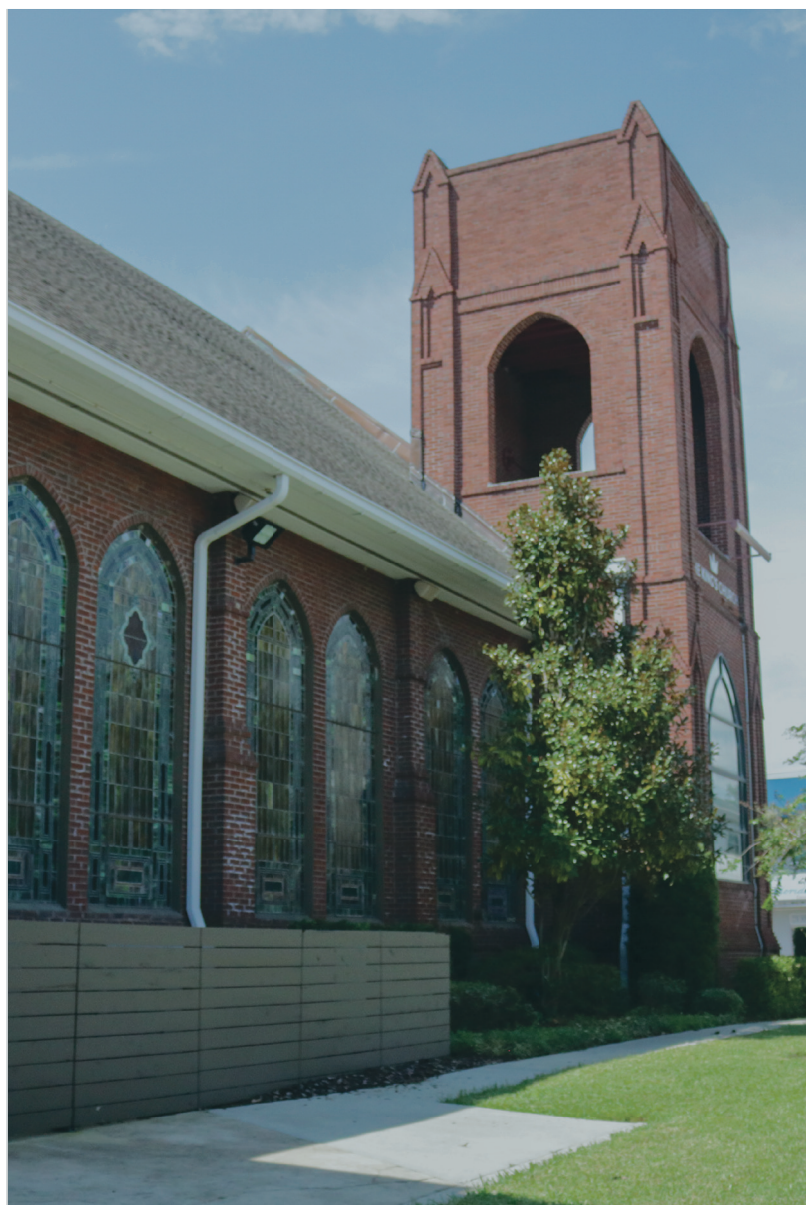
The King's Church, Lakeland, FL

Church Growth Investment Fund offers construction and permanent loans to churches and associations affiliated with the Florida Baptist Convention. We make loans for purchasing property, constructing new facilities, refinancing existing debt and/or renovating existing facilities. The principal and interest paid on these loans supports Gospel ministry throughout the state and around the world.